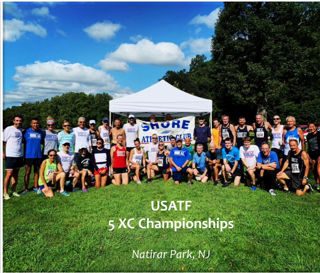
USATF 5 XC Championships